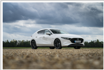
Mazda 3, special model "100th Anniversary Edition" (2020).