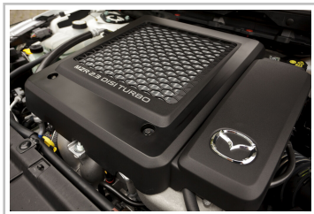
2.3-liter turbocharged engine of the 2011 Mazda 3 MPS.