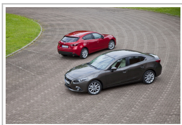
Mazda 3 MPS (2011).