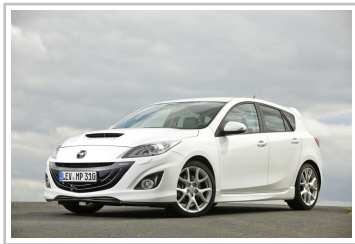
Mazda 3 MPS (2011).