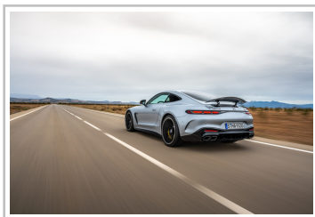
Mercedes-AMG GT 63.