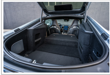
Mercedes-AMG GT 63.