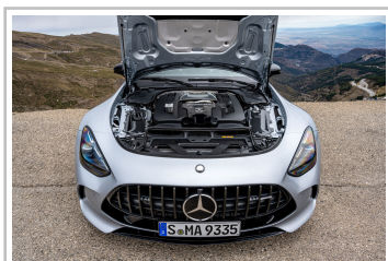
Mercedes-AMG GT 63.