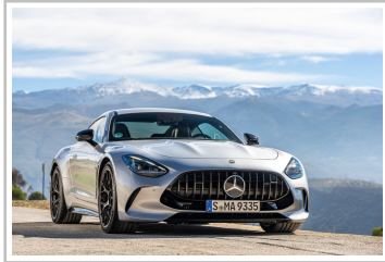
Mercedes-AMG GT 63.