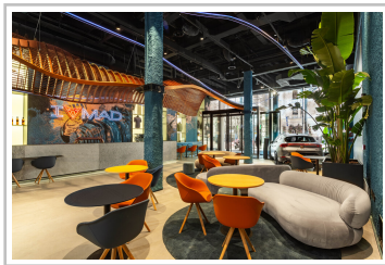
Cupra City Garage Madrid.