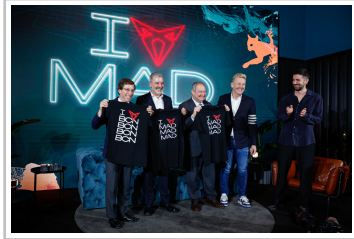
Cupra City Garage Madrid: Opening with Cupra CEO Wayne Griffiths (2nd from right)