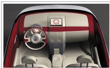
Fiat Concept Trepino study from 2004.