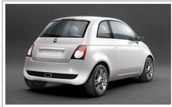
Fiat Concept Trepino study from 2004.