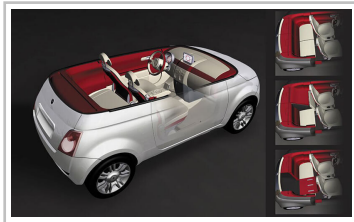
Fiat Concept Trepino study from 2004.