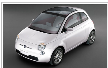
Fiat Concept Trepuno study from 2004.