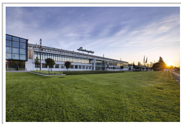
Lamborghini headquarters in Sant'Agata Bolognese.