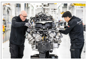
Engine assembly at Lamborghini headquarters in Sant'Agata Bolognese.