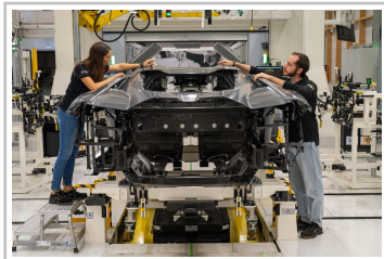
Vehicle production at Lamborghini in Sant'Agata Bolognese.