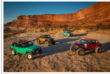
Easter Jeep Safari 2024: Willys Dispatcher Concept, Gladiator Rubicon High Top Concept, Vacationeer Concept and Low Down Concept (clockwise from left to right).