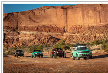
Easter Jeep Safari 2024: Vacationeer Concept, Low Down Concept, Dispatcher Concept and Gladiator Rubicon High Top Concept (from right).