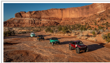
Easter Jeep Safari 2024: Low Down Concept, Willys Dispatcher Concept, Gladiator Rubicon High Top Concept and Vacationeer Concept (from right).